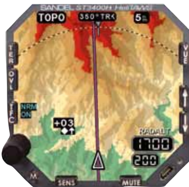
Sandel Avionics' HeliTAWS

Two distinctly different companies arrived at a solution to a single need for helicopter pilots in the last few months.