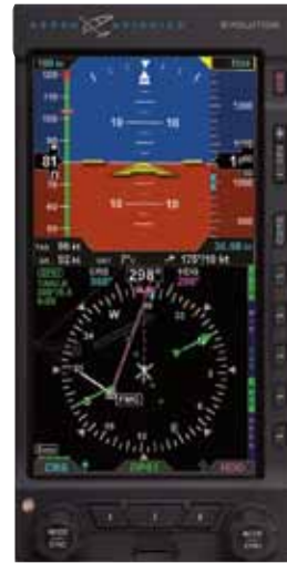
Aspen Avionics' EFD1000H PFD

of two elements of an all-glass cockpit, but in a single-unit, split-screen package. The G500H packages both the PFD and MFD systems side-by-side, each sporting a 6.5-inch (diagonal) screen.