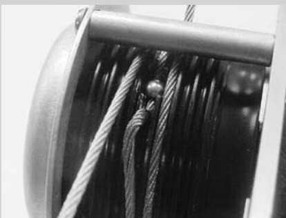
Results of loose primary and bridle cable.