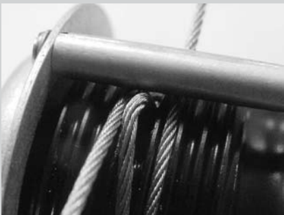
Results of loose primary and bridle cable.

It's Monday morning and you've just arrived at your office. As you head to unlock the outside door, you can't believe what you see: Mr. Beechnut's Skyspam is parked outside your shop again.