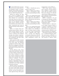
1/3 PAGE SQUARE