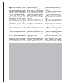
1/2 PAGE HORIZONTAL