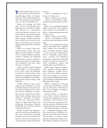
1/3 PAGE VERTICAL