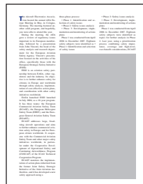
1/2 PAGE VERTICAL