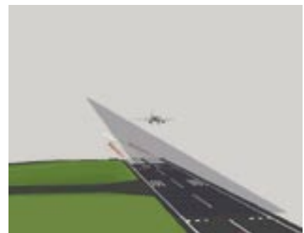
Glideslope animation based on FDR data.