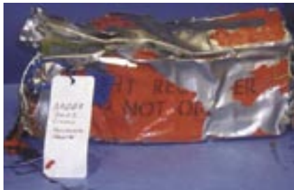
The damaged flight data recorder from EgyptAir Flight 990.

of gravity). Additionally, each must also survive flames at 2,000 degrees Fahrenheit for up to 30 minutes, and submersion in 20,000 feet of saltwater for 30 days. Most flight data recorders are constructed with an aluminum sheet metal chassis, with a protective capsule constructed of heat-treated stainless steel or titanium. Because new solid-state digital recorders have no moving parts and are smaller than their predecessors, they are lighter than analog tape devices, and use less power. In many accidents, the only devices that survive are the Crash Survivable Memory Units (CSMU) of the flight data recorders and cockpit voice recorders. Typically, the rest of the recorders' chassis and inner components are mangled. The CSMU is a large cylinder that bolts onto the flat portion of the recorder. This device is engineered to withstand extreme heat, violent crashes and tons of pressure. In older magnetic-tape recorders, the CSMU is inside a rectangular box.