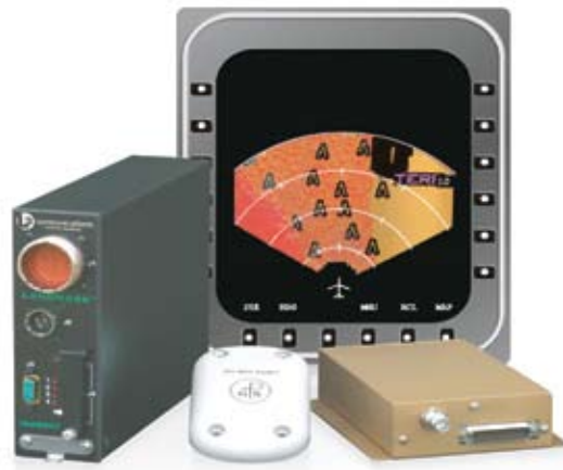
L-3's LandMark 8100 with WAAS/GPS

the location of all the runway ends at all the airports in its vast database; so, it can change the warning cycles for aircraft descending and within five miles of an airport.