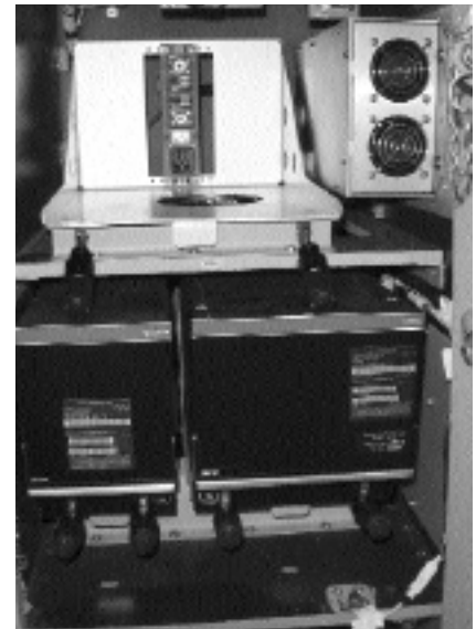
SATCOM Rack Assembly.

only a 0.1-inch lateral movement and only a 0.2-inch vertical movement is possible. If you see Mr. Hairy Knuckles using excessive side-to-side or up and down motion to disengage the unit, make sure he learns the trick of holding a charged capacitor on his tongue.