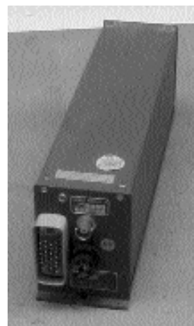
A remote glide slope

Now the signal has reached the receiver. The receiver tunes to the correct frequency and provides a composite signal to the converter circuits and a nav audio signal to the aircraft audio system. The pilot is required to use the audio signal to verify that he has tuned to the right facility for navigation. The composite signal is utilized by the nav converter to “convert” the information contained in the composite signal to needle, to-from, and flag information on the pilot’s navigation display. In addition to the composite signal, the receiver sends an ILS energize discreet to the converter to switch the converter circuits from VOR mode to LOC mode. In ARINC nav systems, there will be an automatic converter that is utilized to drive RMI systems. The channeling scheme for VHF nav covers the 108.00 to 117.95 Mhz frequency spectrum in 50 KHz increments, providing 200 individual channels. Localizer channels are the odd tenths from 108.10 (including the .05