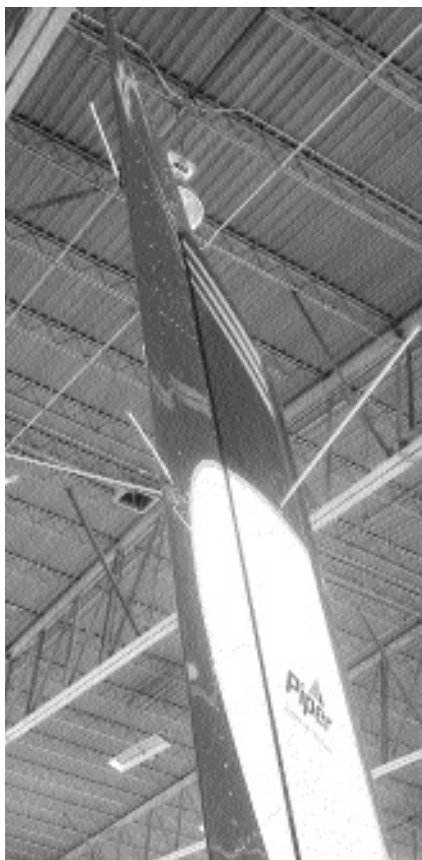
Nav dipole antenna, affectionately known as cat whiskers.

T he VHF nav, or VOR (Very high frequency OmniRange), has been the mainstay of the en route navigation system in the United States since the 1950s with its development rooted in World War II. The VHF ILS (Instrument Landing System) was also pioneered in World War II and adopted in the United States during the 1950s. Obviously this was before my time and I have no direct knowledge of how someone could have thought of such a wonderful system.