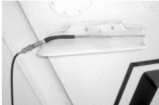
Testing a nav blade antenna element.

If the answer is no, just the opposite applies. Let's assume the answer was "Yes, there was an ident." The next question to ask would be, "Is the