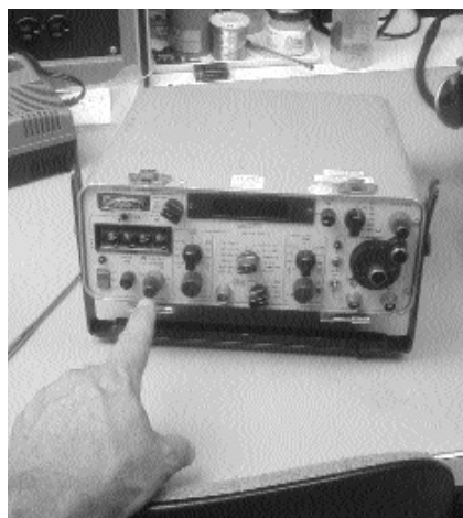
Make sure these controls are fully clockwise when using the NAV-401L