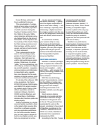
1/6 Page 2" x 4 1/4"

(trimmed to 7 1/2" x 10") allow 1/2" from all text to spiral binding