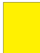
IFC, IBC, BC (Full Bleed) 7 3/4" x 10 1/4"