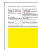
Half Page 6 1/4" x 4 1/4"